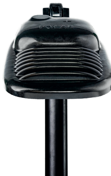
POLAB VALDUR BLACK